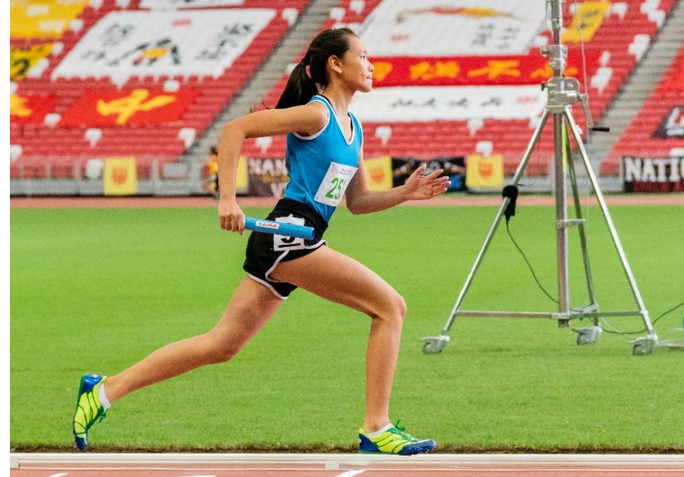
Track & Field