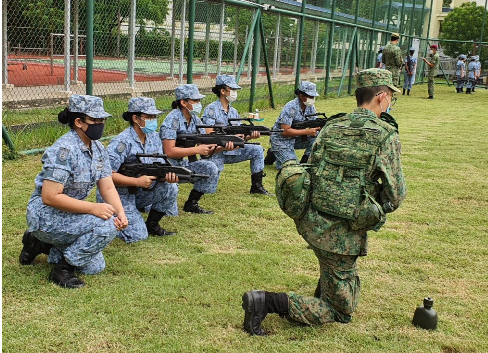
NCC Air Girls