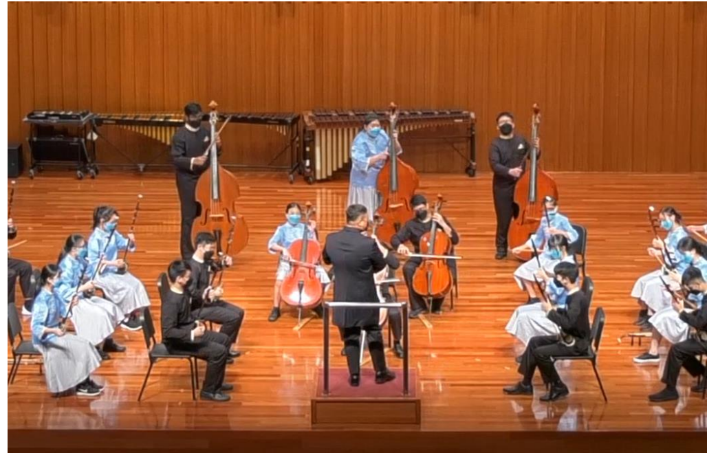
Chinese String Ensemble