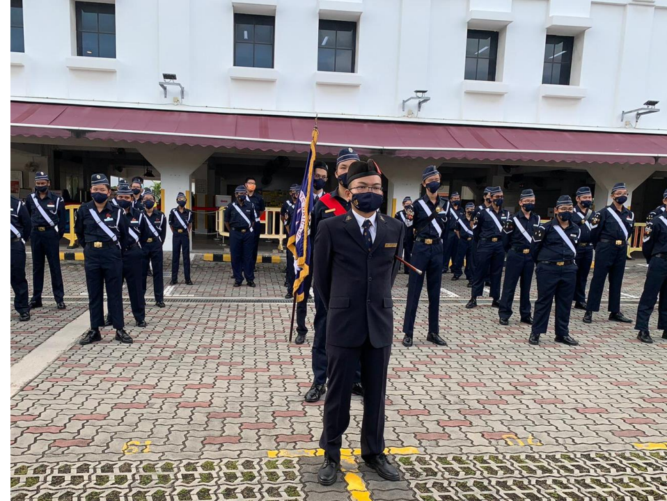
The Boys' Brigade