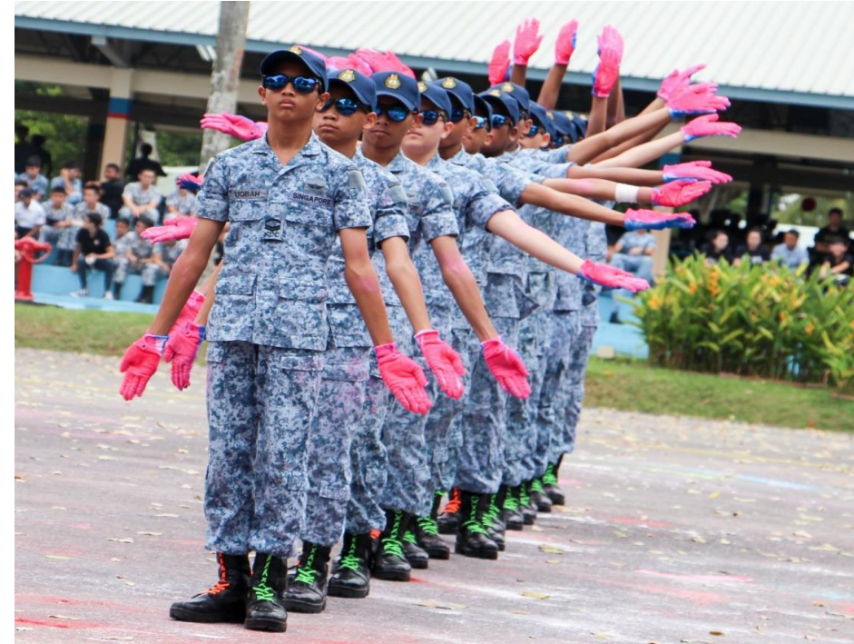
NCC Air Boys