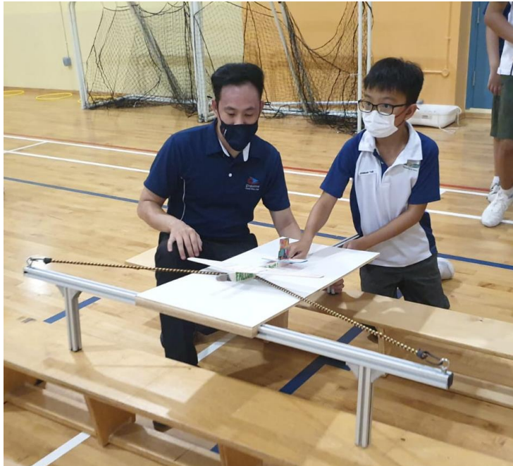
Singapore Youth Flying Club